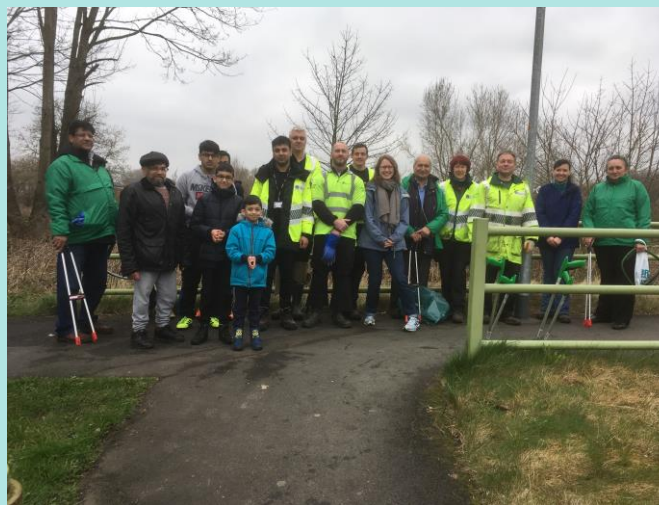
Clean up day involving members of the local Flood Action Group

We had to go to my grandparents' house because there was a big chance that the water would get into the house. Our house is a bungalow, so we couldn't put anything upstairs either. We had to stay at our grandparents' house for a few nights. This was because there was also a huge power cut and so our house wouldn't have any power which meant it would be cold and dark in December. When we went back to our house, we had good news. No water had come into our house and the water had gone, but our garden was black and dirty. Our neighbour's house had flooded though, and more houses on our street and some of my friends' streets so my big brother, my mum and my dad helped with the clean-up. In fact, a lot of people came to help and the youth centre became a place people could get water and food from as well as cleaning items too.