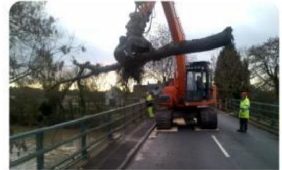
Removing debris from rivers to keep them flowing