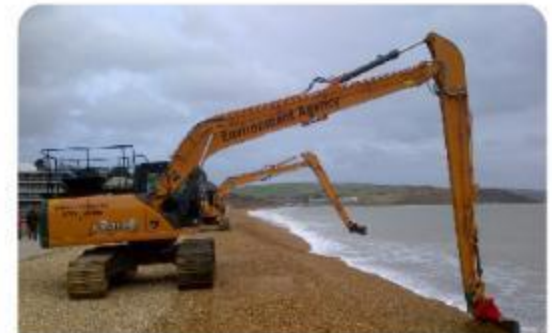
Repairing nature's natural defences after storm damage