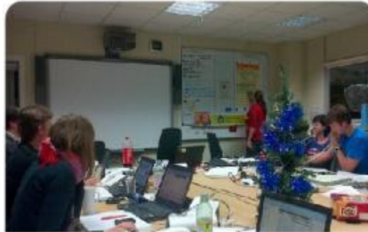
Running incident rooms so we can warn and inform people