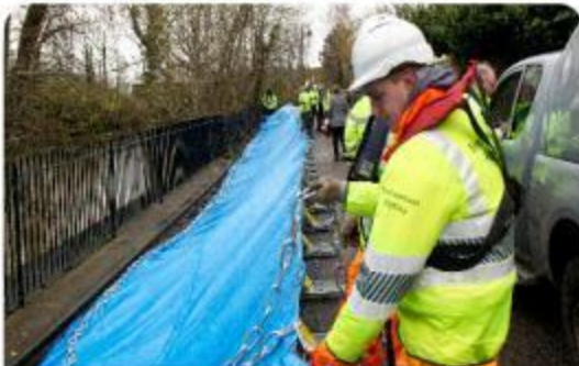
Deploying temporary defences to protect homes and businesses