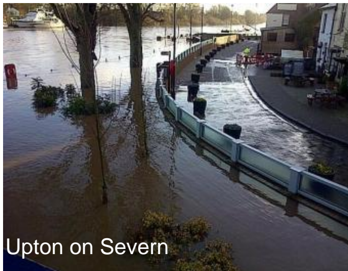
Upton on Severn