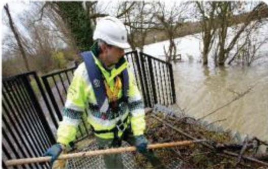
Clearing trash screens so culverts don't get blocked