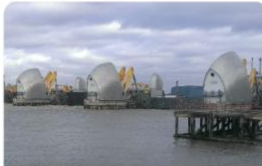
Closing flood barriers to protect communities