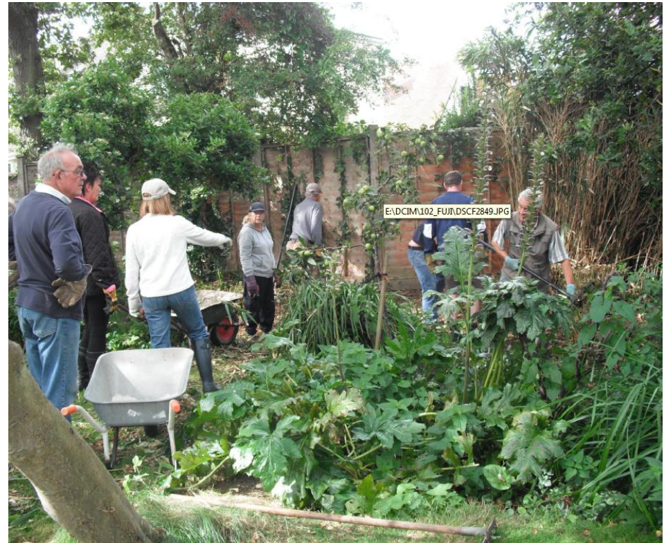
Local flood action group assessing scale of the challenge