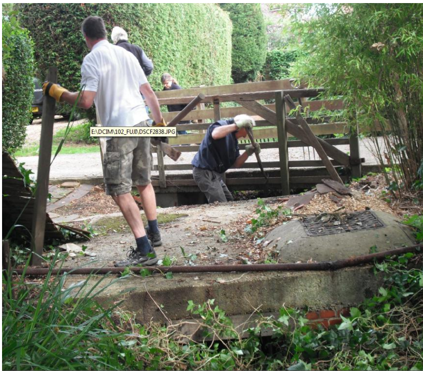
Blocked and overgrown ditches in West Felpham hampering drainage