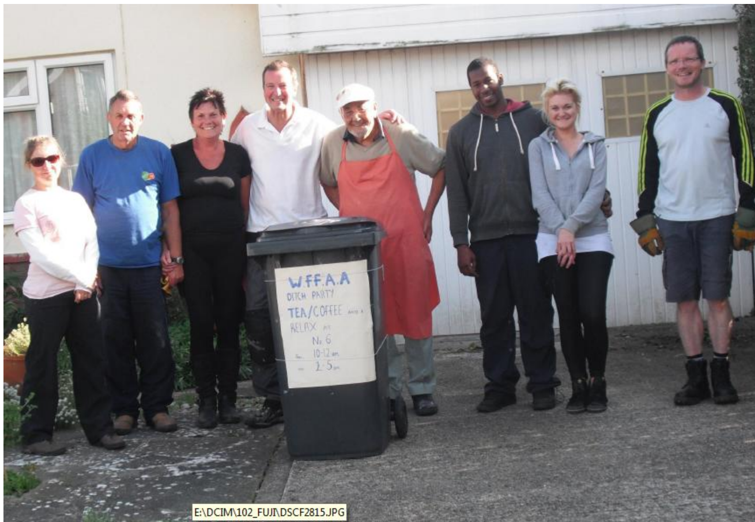
West Felpham Flood Action Association – rightly proud and a little tired